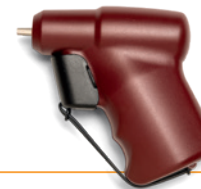
EZIO Power Driver